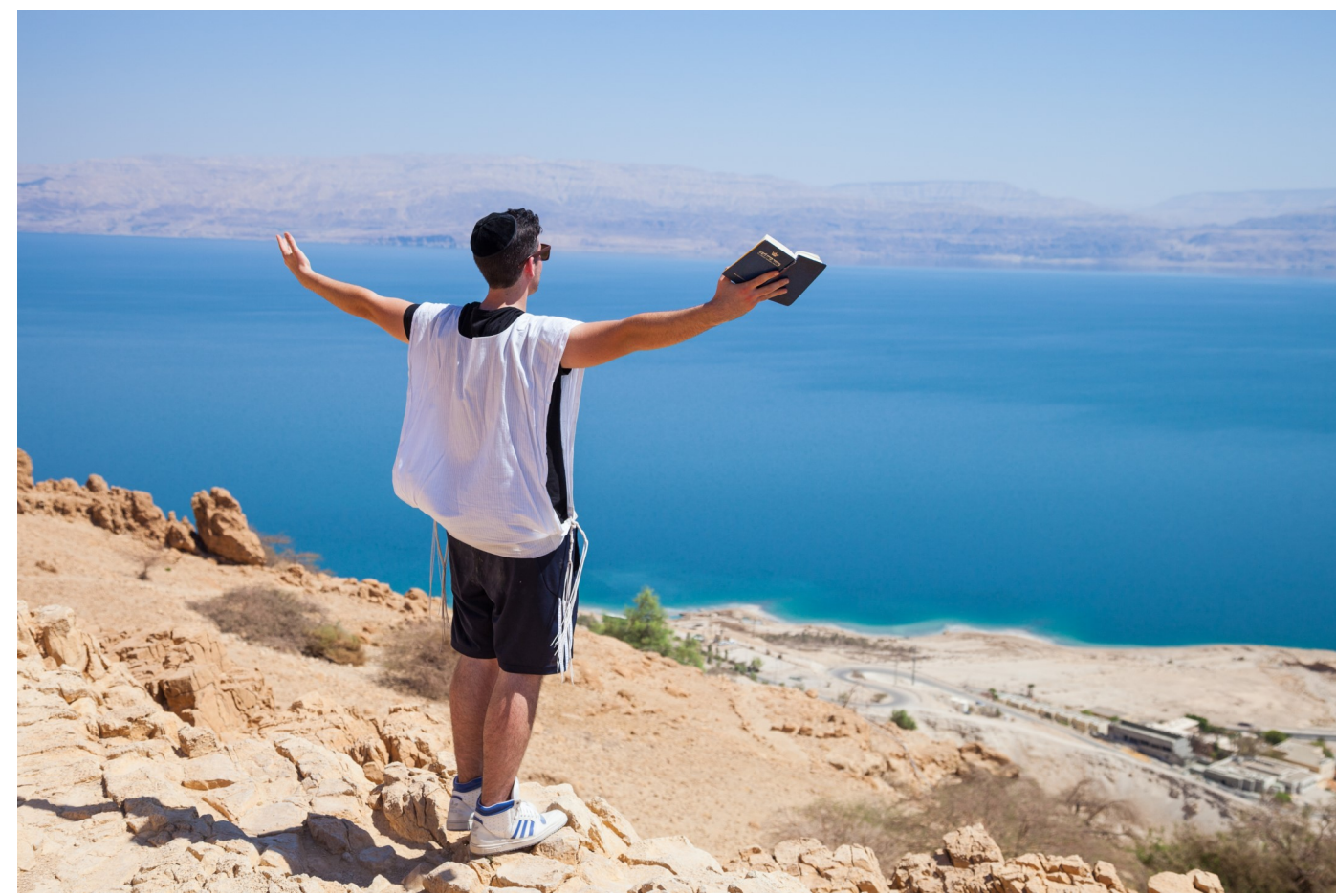
A Visitor Overlooks the Dead Sea During High Holy Day Season in September, 2016

"A young Jewish-American man on a visit to Israel connects with the spirituality of the Israeli desert and the Dead Sea during the Jewish High Holy Day season." Picture and caption by Israeli photographer Udi Goren. See "About Udi Goren" on the bottom of page 5. Goren visited TAY and other NH venues in the Spring of 2017.