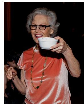
Adults like ice cream, too.