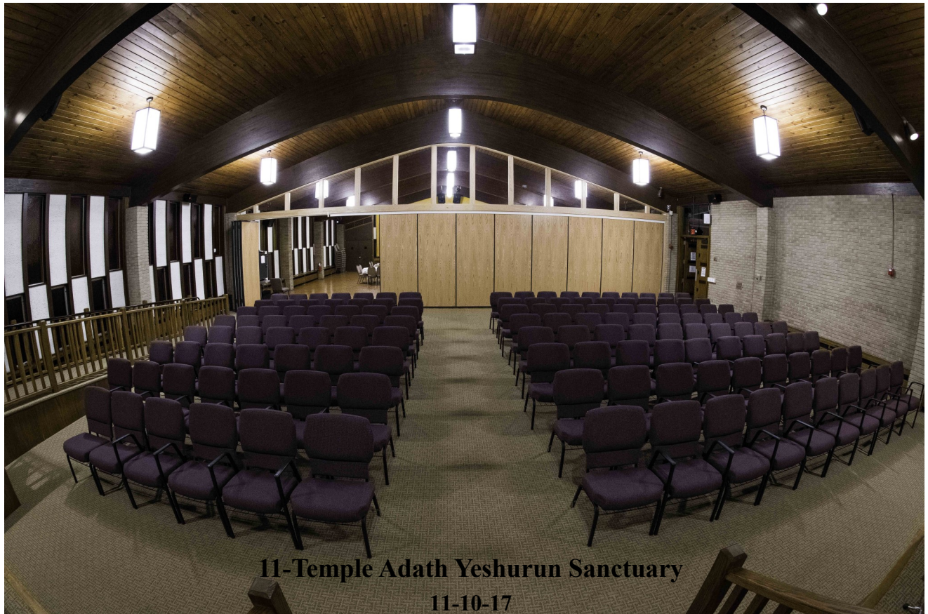
11-Temple Adath Yeshurun Sanctuary 11-10-17

11-10-17. The renovated sanctuary and social hall with comfortable, movable seating, new carpet, the handicap ramp, partially open separating wall, LED lighting and new sound system control console. Note the illumination of the beautiful wood ceiling and arches from the up-and-down lighting designed by the original architects as an inverted ark.