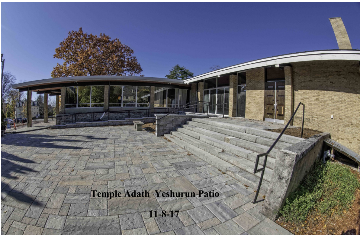
Temple Adath Yeshurun Patio 11-8-17

11-10-17. The renovated sanctuary and social hall with comfortable, movable seating, new carpet, the handicap ramp, partially open separating wall, LED lighting and new sound system control console. Note the illumination of the beautiful wood ceiling and arches from the up-and-down lighting designed by the original architects as an inverted ark.