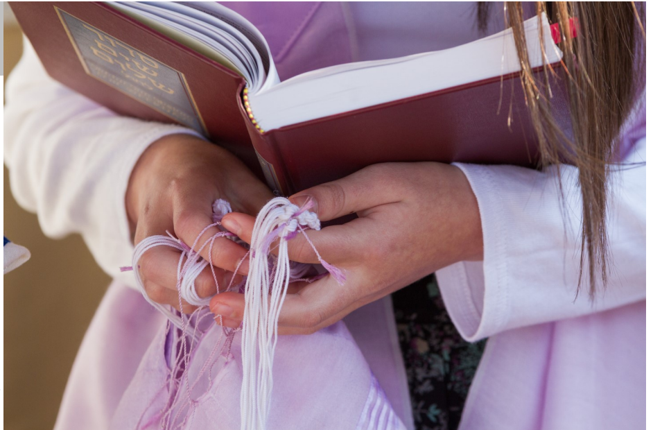
10-2-14. “A young adult tightly holds on to her talit while reading her parsha during her Bat Mitzvah service on top of Mount Masada in Israel.” See info on Goren’s Israel Trail book on p. 2, and another photo on p. 17.

I realized over 40 years ago that this soundtrack plays regularly around the