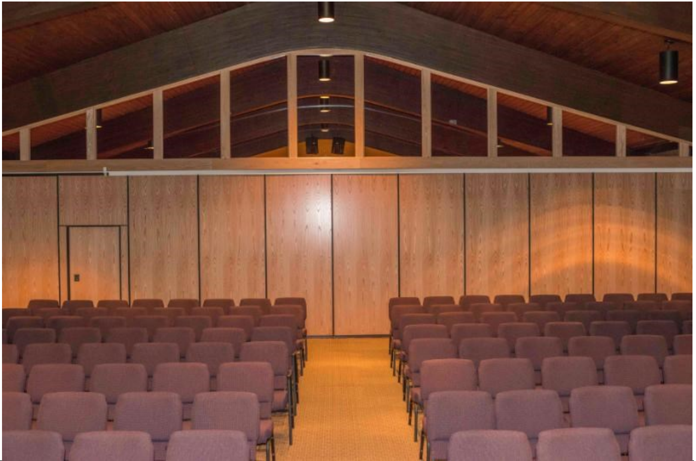
New Wall: Sanctuary Side, March 3, 2017