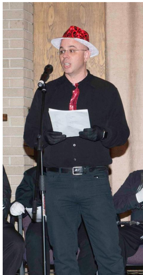
BOO! HISS! MAY HIS NAME BE BLOTTED OUT!

Never met a Jew that I liked. They are useless in my view. They will all be swingin' While I'm singin' Master of the Jews.